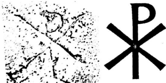
The first two Greek letters in the word Christ.

Often undervalued (or overlooked altogether) are early Christian symbols. I was in Rome this March and had the pleasure of visiting the catacombs. Here Christians were buried outside Rome from between 90-300 AD. On many of these graves were inscribed in the rock Christian symbols. It should be kept in mind that Christians were not the flavour of the day in Rome at this time. Therefore, symbols became ways of confessing you were a Christian. We still employ such symbols even today when we gather for worship. Let's look at a few.